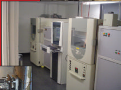
Endurance Testers with Environmental Chambers

All units performance tested for torque, current drain and engagement voltage. Current is oscilloscope tested.